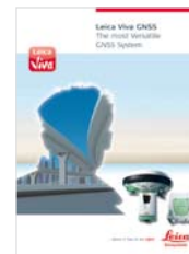
Leica Viva GNSS Product brochure