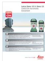
Leica Zeno GNSS/GIS Handhelds Datasheet