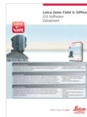
Leica Zeno Field & Office GIS Software Datasheet