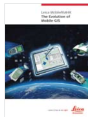
Leica MobileMatrixX Product Brochure

Other trademarks and trade names are those of their respective owners.